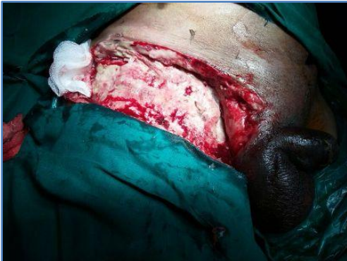
Fig. 1: Wound after first debridement

CONCLUSION: Necrotizing fasciitis is rapidly progressive extensive necrosis of subcutaneous fat and fascia; is more common in middle aged males. Findings at surgical exploration and skin biopsy are reliable methods of diagnosis. Treatment includes early and adequate surgical debridement, parenteral antibiotics and nutritional support. The diagnosis of tuberculosis should be suspected in patients of NF with recurrence or delayed response to treatment.