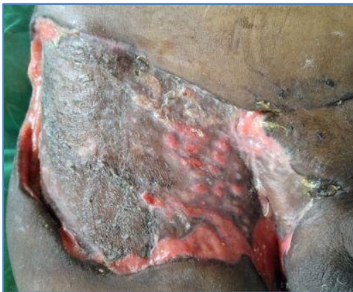
Fig. 3: Wound after skin grafting